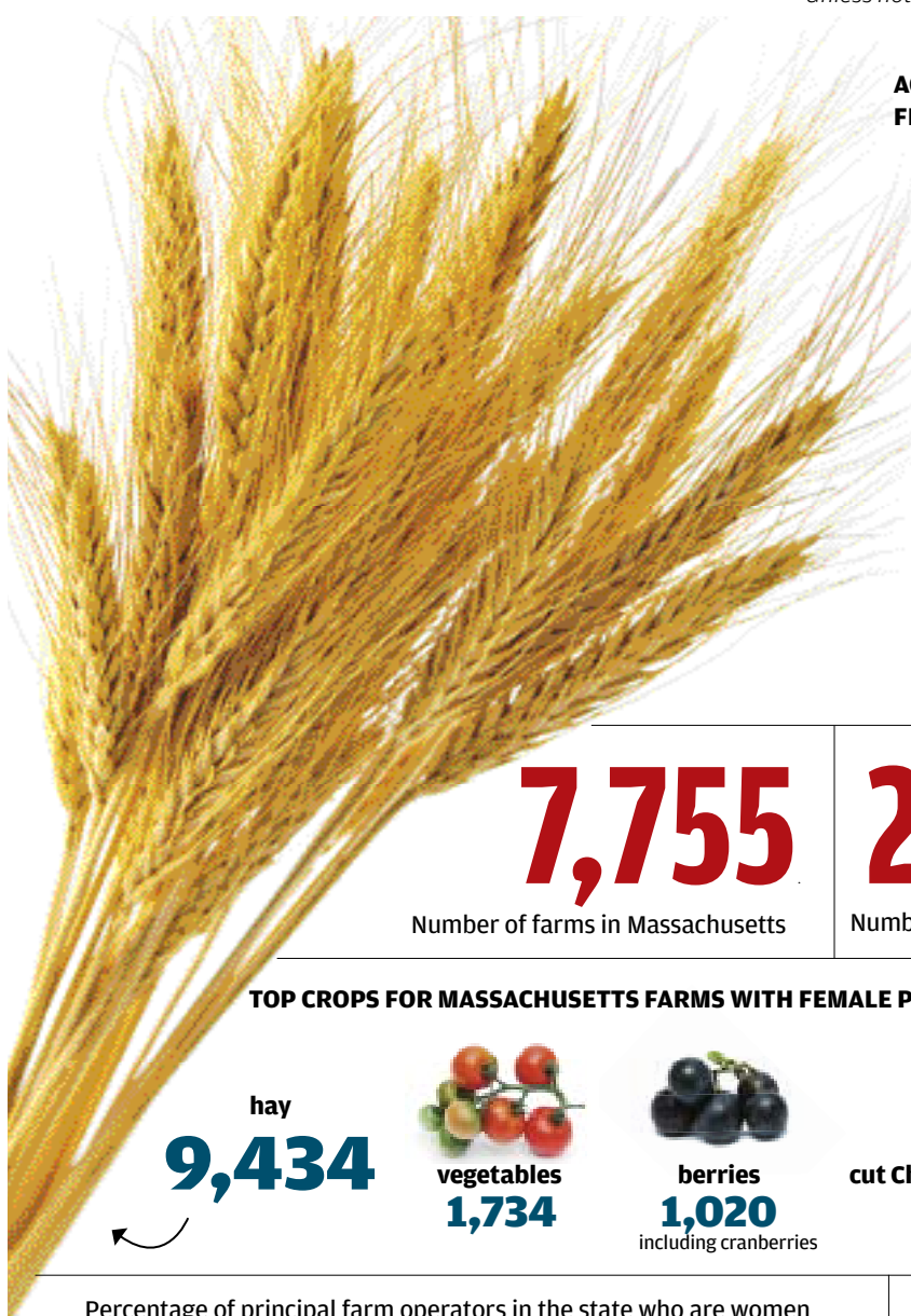
AGE BREAKDOWN OF THE STATE'S FEMALE PRINCIPAL FARM OPERATORS

Unless noted, all figures are from 2012, the last year of the USDA's agricultural census.